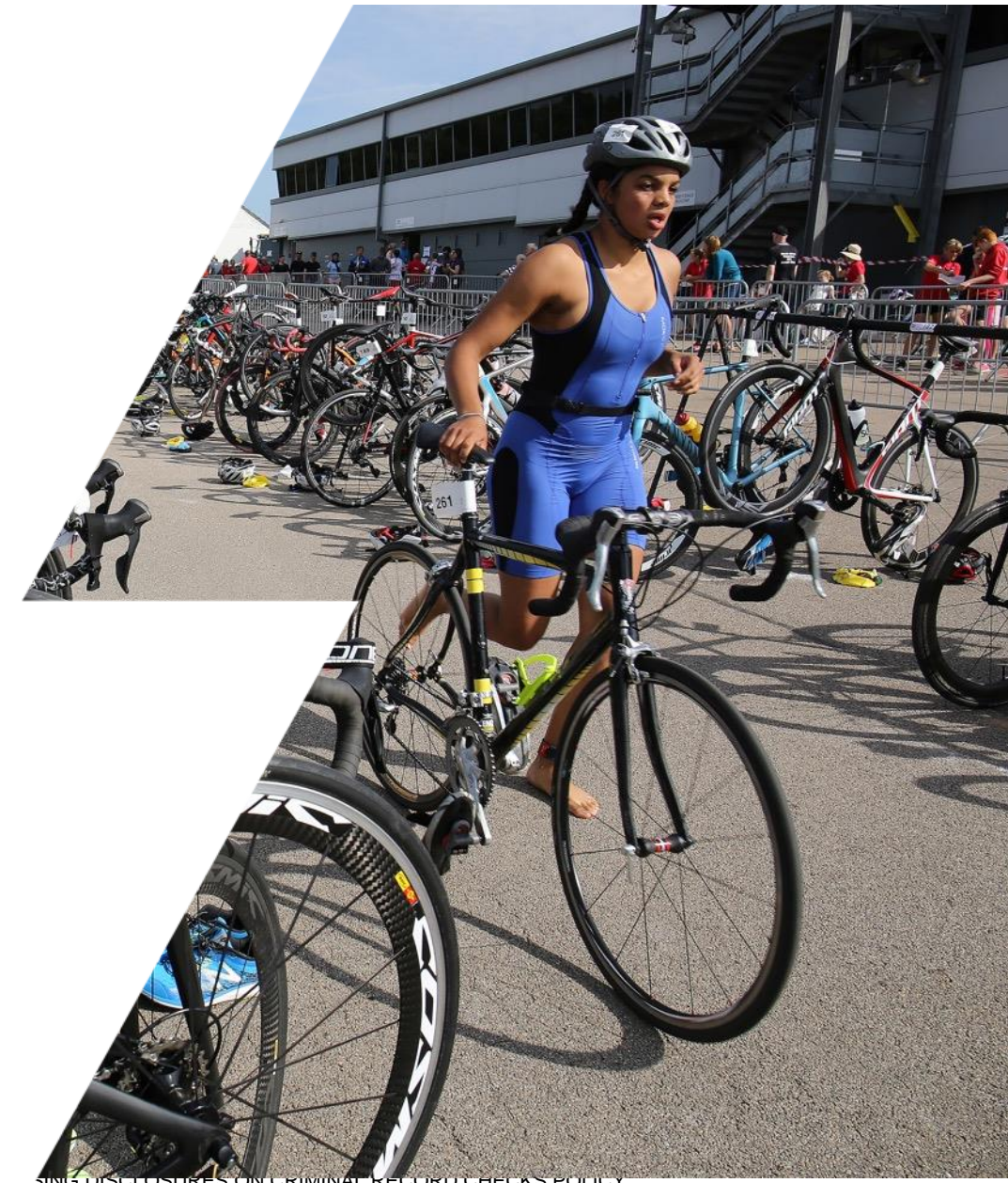
SING DISCLOSURES ON CRIMINAL RECORD CHECKS POLICY

The individual will be notified as soon as possible after the risk assessment has been carried out. Their Club and or Club Welfare/Wellbeing Officer will also be notified of the decision but they will not be provided with any details of the disclosure listed.