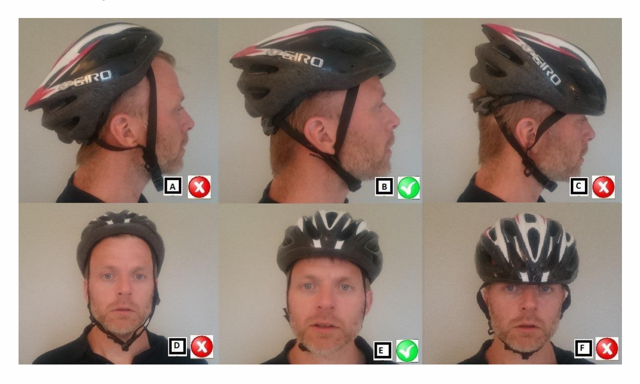
Image shows acceptable and inappropriate helmet positions. Children in particular may push the helmet back (as shown in A & D) , coaches should give guidance on this as this will give little protection in frontal impacts.